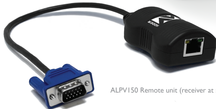
ALPV150 Remote unit (receiver at screen)

© Copyright 2011 Adder Technology Ltd. All brand names and trademarks are the property of their respective owners. LM-ALPV154v4.J5.indd