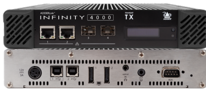
ALIF4000 TX - Front & Rear