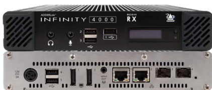
ALIF4000 RX - Front & Rear