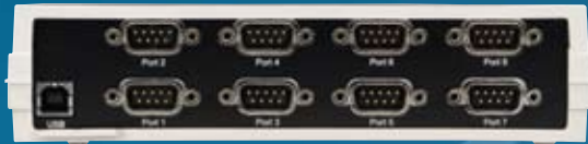
IC1002A: rear view